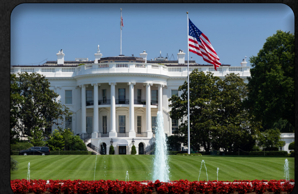
The White House (12min Drive/Uber)

The Alabama Implant Study Group is designated as an Approved PACE Program Provider by the Academy of General Dentistry. The formal continuing education programs of this program provider are accepted by the AGD for Fellowship/Mastership and membership maintenance credit. Approval does not imply acceptance by state or provincial board of dentistry or AGD endorsement. The current term of approval extends from February 1, 2022 - Jan 31, 2025 Provider ID# 215215