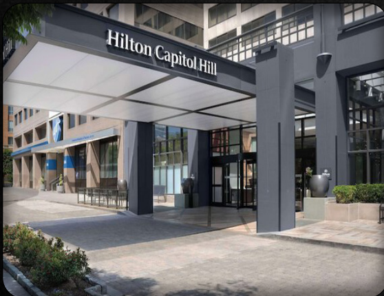
Hilton Washington DC Capitol Hill