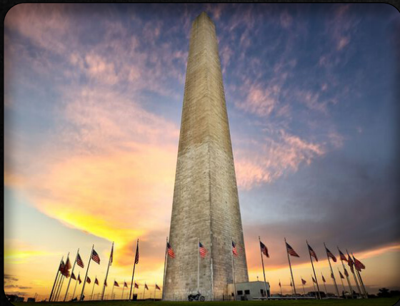
Washington Monument (10min Drive/Uber)