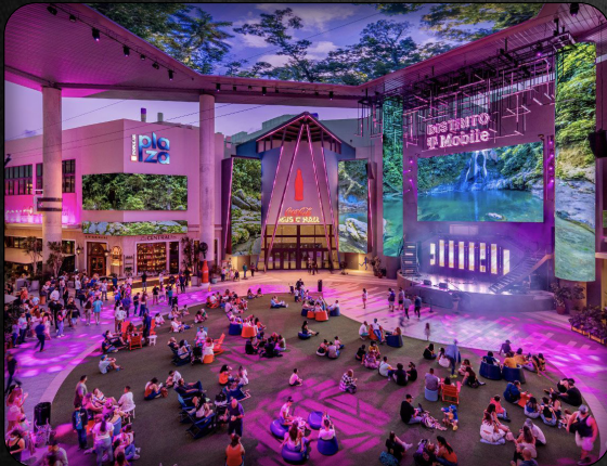
T-Mobile District San Juan, PR (Adjoining Hotel)