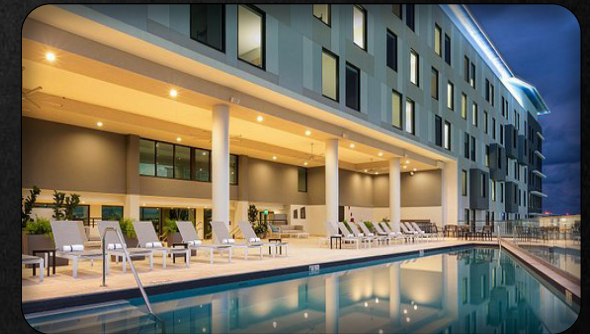
Aloft San Juan Pool Deck