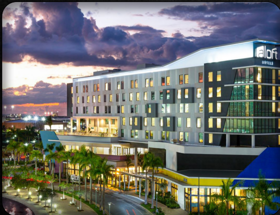
Aloft San Juan (Convention Blvd)

**Please Include E-Mail and # of Guests**