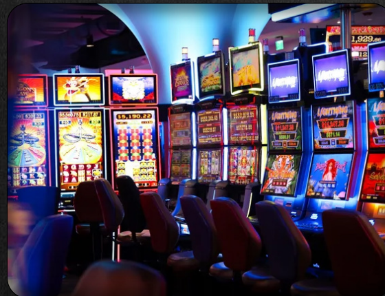
Casino Metro San Juan, PR